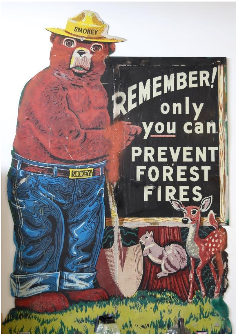
Picture 2. Preventing the wildfires include information sharing to the people.

Climate change is altering conditions for wildfires, with the forest fire season expected to lengthen, fires becoming more intensive, and control becoming more challenging. Exceptional wildfire conditions may arise in places not prepared for severe forest fires . Sharing knowledge among Arctic Countries' wildfire specialists can enhance all stakeholders' prevention and preparedness for future wildfire seasons.