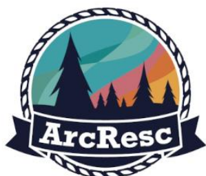
Picture 1. ArcResc -logo.

The Finnish Association of Fire Officers has managed the Capacities of the Rescue Services in the Arctic: Advancement of Knowledge and Cooperation (ArcResc) project. The project has facilitated international cooperation and knowledge exchange in the field of fire and rescue services within the Arctic Region, covering Finland, Sweden, Norway, Iceland, Greenland, Canada, and Alaska. This two-year project has successfully established a network among operational-level Arctic fire and rescue service actors. Funding for the project has been provided by the Ministry for Foreign Affairs of Finland and supervised by the Ministry of the Interior of Finland.