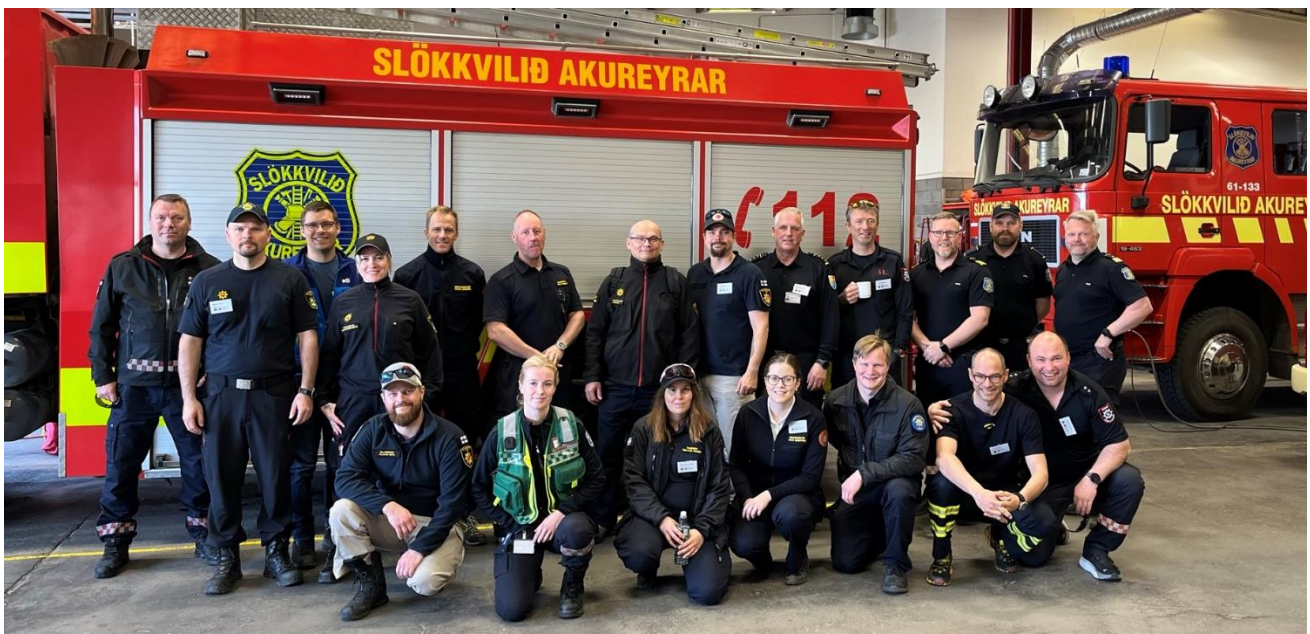
Picture 3. ArcResc Network Sharing the knowledge in the ArcResc Meeting Iceland.